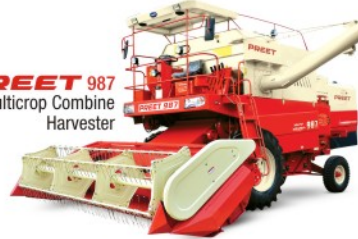
PREET 987 4x4 Multicrop Combine Harvester

When machines take over the farming, they are going to need a leader.