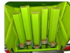
Long length straw walkers for complete separation of grains and straw.