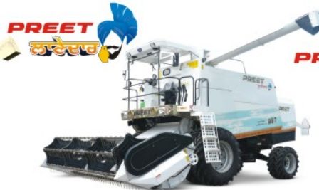
PREET 987 DLX Multicrop Combine Harvester