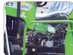
Easily approachable levers for operator convenience and comfort during field operation.