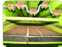
Clean grains obtained through highly efficient mechanism. Easily adjustable sieves opening for varying grain conditions.