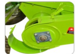
Easy to open elevators for maintenance and service