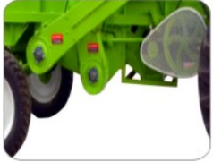
Higher ground clearance

Preet Combines is india's most popular and ideal combine harvester now with new feature and colour. This is a multicrop self propelled combine harvester and ideal for harvesting of crop like Wheat, Paddy, Soyabean, Sunflower and Mustard etc. We offer combine harvester with wide feature. Some of the feature are stated as under :