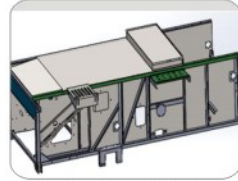
Heavy duty robust structure to withstand varying field conditions