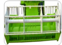
Broader cutter bar covering more area for crop intake and supported with well designed reel to hold the crop.