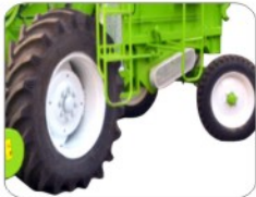
Low turning radius enabling to turn the machine in small space.