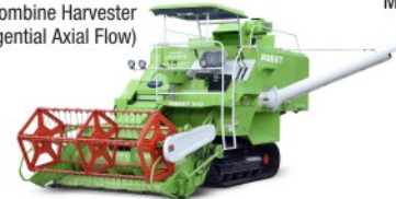
PREET 949 Track Combine Harvester (Tangential Axial Flow)