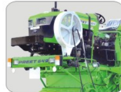
Powered by fuel efficient Tractor