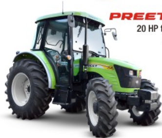
PREET Tractors 20 HP to 100 HP Available