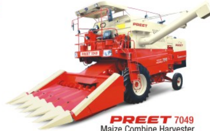
PREET 7049 Maize Combine Harvester