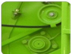
Good quality bearings used for supporting rotating parts to give more durability.